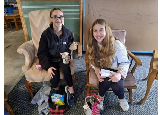
Youth Gift Exchange