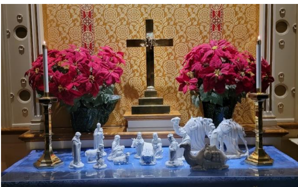
The Reason for the Season!