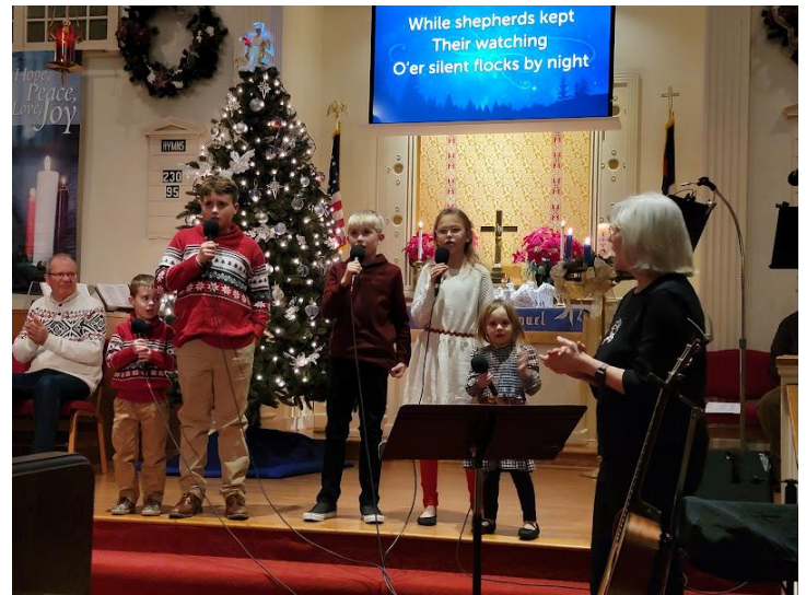
Christmas Eve Special Music and the kids leading us in song