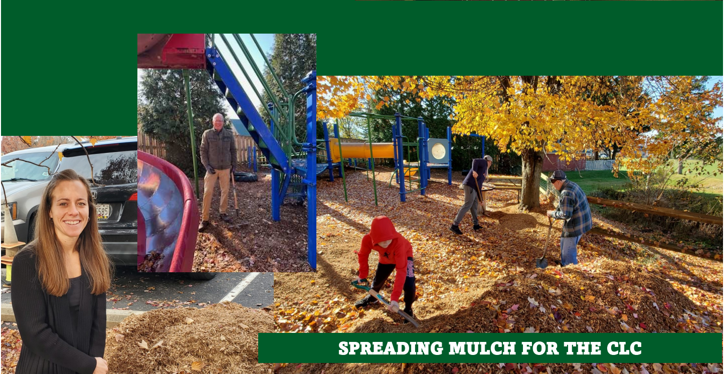
SPREADING MULCH FOR THE CLC