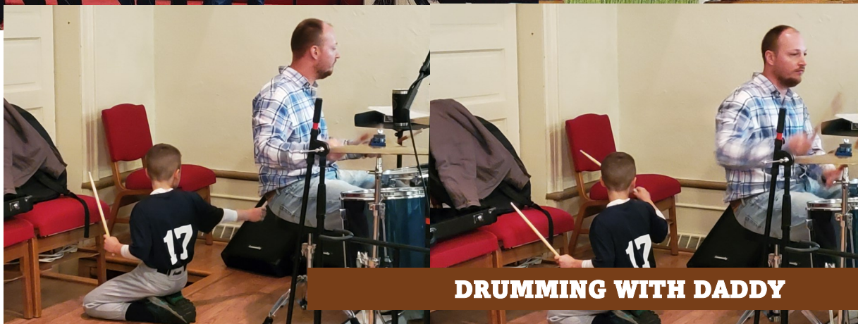
DRUMMING WITH DADDY