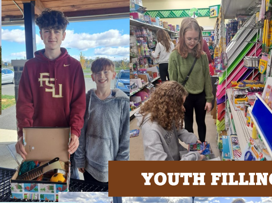
YOUTH FILLING SHOEBOXES