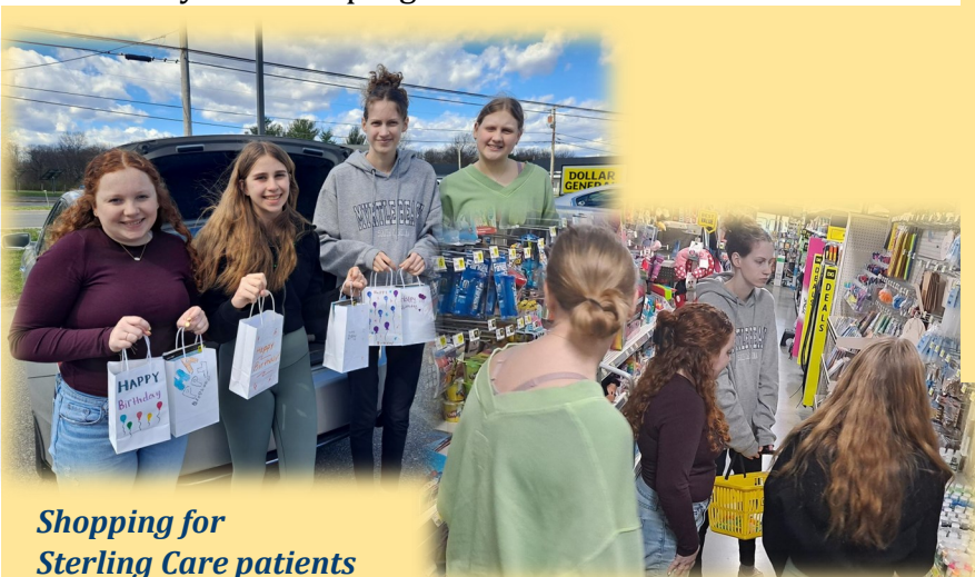
Shopping for Sterling Care patients