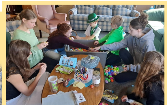
Filling Easter Eggs