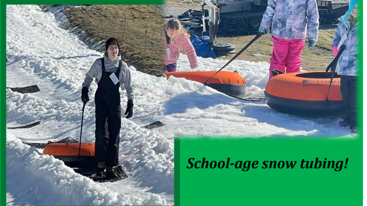
School-age snow tubing!