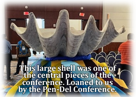
This large shell was one of the central pieces of the conference. Loaned to us by the Pen-Del Conference.