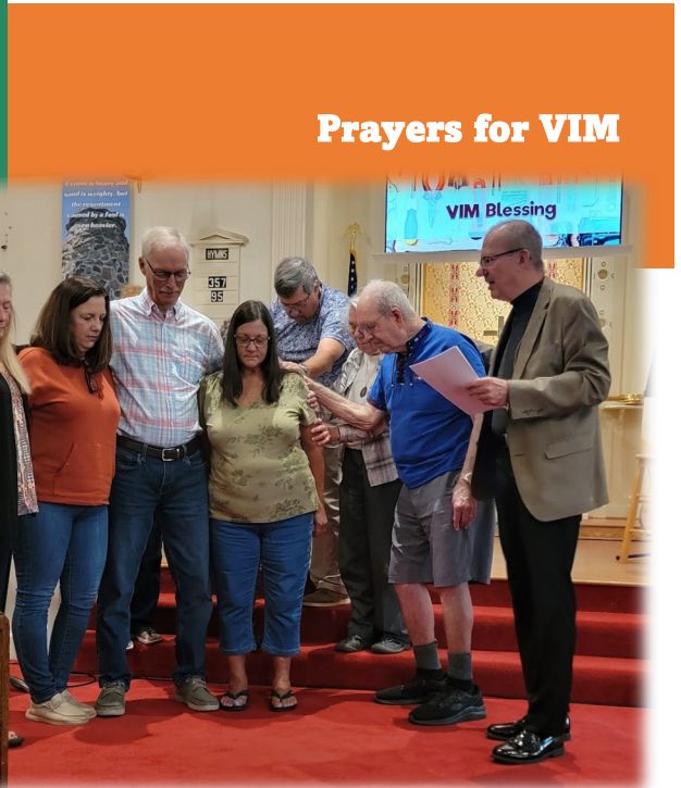
Prayers for VIM