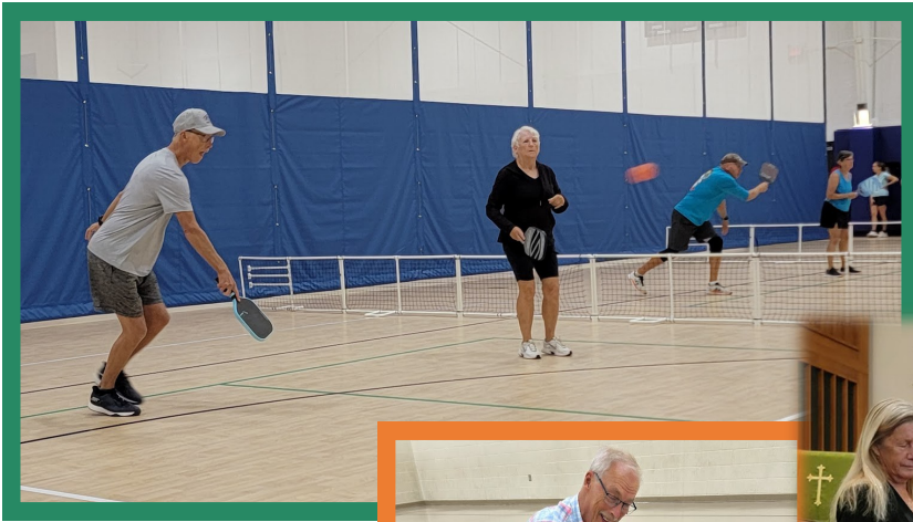
New Pickleball tape after stripping the floors and Installing New Speakers