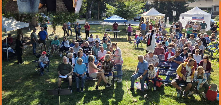
Boonesborough Days Ecumenical Service